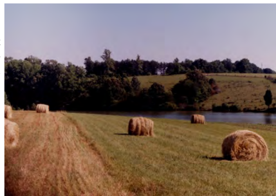
Right: One of the West Piedmont Planning District's many agricultural areas.