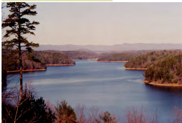
Left: Philpott Lake.

"TEACHING THE PUBLIC ABOUT POTENTIAL HAZARDS WILL HELP EACH OF THE AREA'S JURISDICTIONS PROTECT THEMSELVES AGAINST THE EFFECTS OF HAZARDS, AND WILL ENABLE INFORMED DECISION MAKING ON WHERE TO LIVE, PURCHASE PROPERTY, OR LOCATE BUSINESSES"